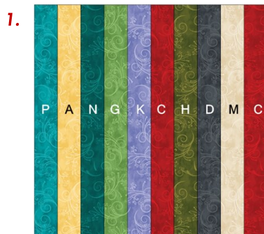
BLOCK 1 (make 15)