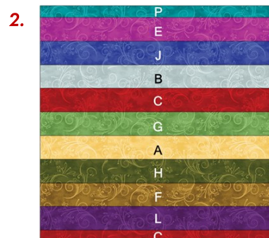
BLOCK 2 (make 15)