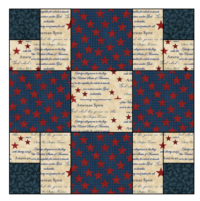
BLOCK 1 make (6)